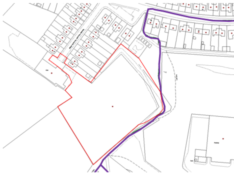
Fig. 7- Route of public right of way relative to application site