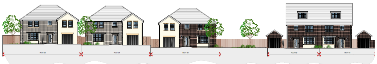
Fig. 3- Street scene north to south- plots 1-5.