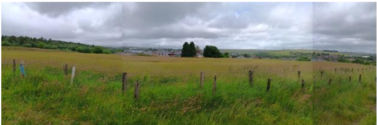
Fig. 5- View across the site from public footpath towards Ashvale Sports club and the dwellings in Griffiths Gardens.