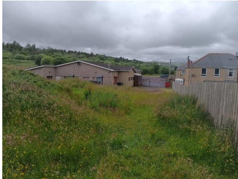
Fig. 12- Internal view of existing access to site