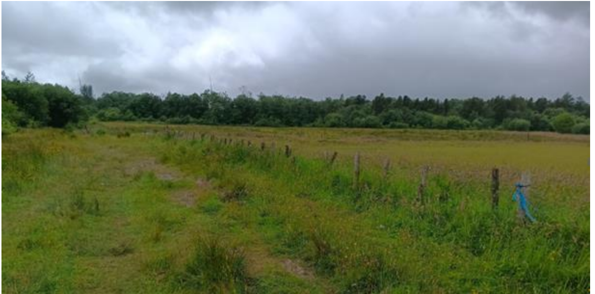
Fig. 8- Public right of way adjacent to southern boundary leading to Bryn Bach Parc.