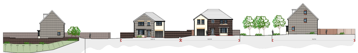
Fig. 4- Street scene west to east- plots 1, 9, 10 and 20. Dwellings look towards the access and Griffiths Gardens.