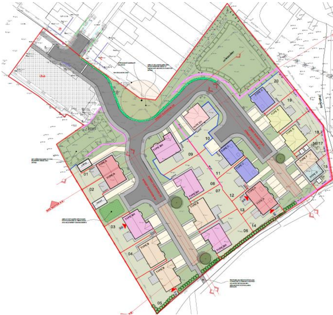
Fig. 2- Proposed site layout.

1.5 The schedule of accommodation details the following mix: