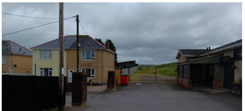
Figs. 10 and 11 - Existing access from Griffiths Gardens into the site.