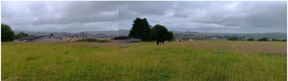
Fig. 6- View from within the site towards Ashvale Sports Club and the dwellings in Griffiths Gardens.

the properties in Griffiths Gardens. Although the land was previously used as sports pitch, it has most recently been used for grazing purposes.